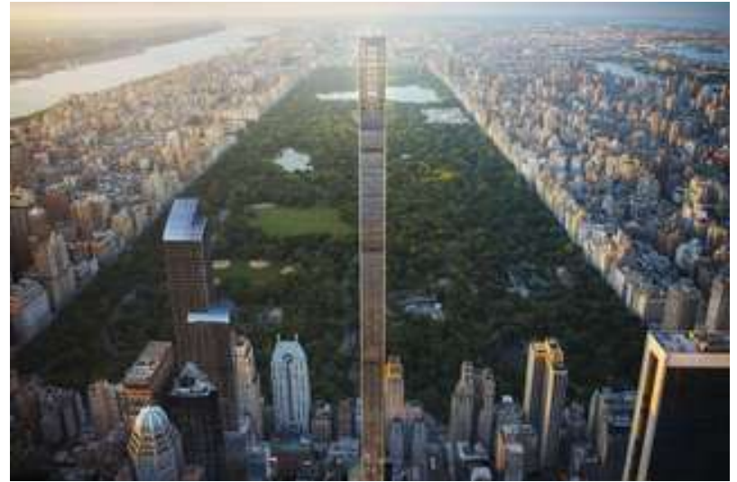
111 West 57th Street

111 West 57th Street 3 Beds from $18,000,000 4 Beds from $56,000,000