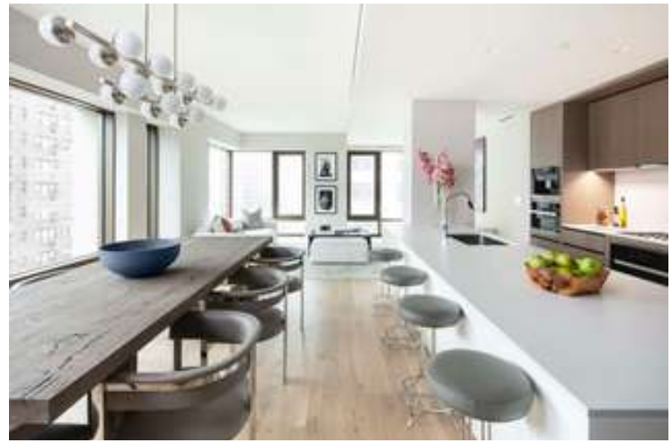
200 East 21st Street

3 Beds from $6,700,000 4 Beds from $9,300,000 5 Beds from $28,000,000