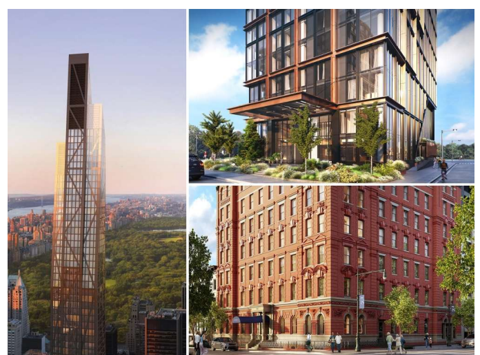
(New York City new developments (L to R: 53W53, Quay Tower, 101 West 78th Street)

n our latest market report, the average sales price in Manhattan dipped slightly in the four weeks leading up to September 1, but the number of recorded sales went up. The average sales price for all units, including co-ops and condos, was $1.95 million, down from $2.2 million in the prior month. The number of recorded sales, 1024, was up from the 980 recorded the preceding month.