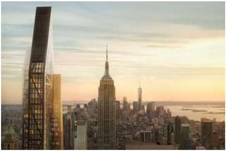
53 West 53rd Street

53 West 53rd Street 1 Beds from $5,190,000 2 Beds from $6,420,000 3 Beds from $7,355,000 4 Beds from $17,400,000