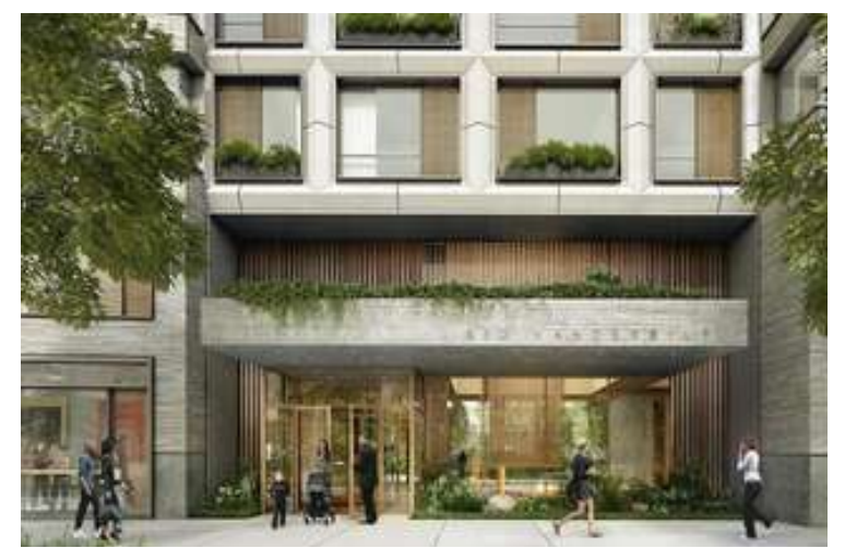
550 Vanderbilt Avenue

Quay Tower 2 Beds from $1,975,000 3 Beds from $3,200,000 4 Beds from $4,450,000