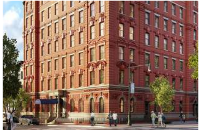
101 West 78th Street

101 West 78th Street 3 Beds from $5,950,000 4 Beds from $7,750,000