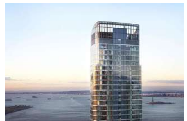
90 West Street