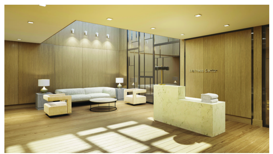
Front lobby of the building's Wellness Center; artist rendering courtesy of Alfa Development

At 200 East 21st Street, gleaming new construction seamlessly integrates into the historic Gramercy Park area, balancing rock-star glamour (Anton Perich portraits of Factory-area Warhol and the downtown demimonde adorn the entryway) with earth-friendly elements in a luxurious 21-story building. From the lobby's living green wall featuring indigenous plants to the green roof, which provides natural insulation and reduces "heat island effect," meticulous attention has been paid to eco-details. Oversize double-paned European windows with tasteful bronze frames and high thermal performance bring in abundant natural light, while reducing noise pollution and heat gain.