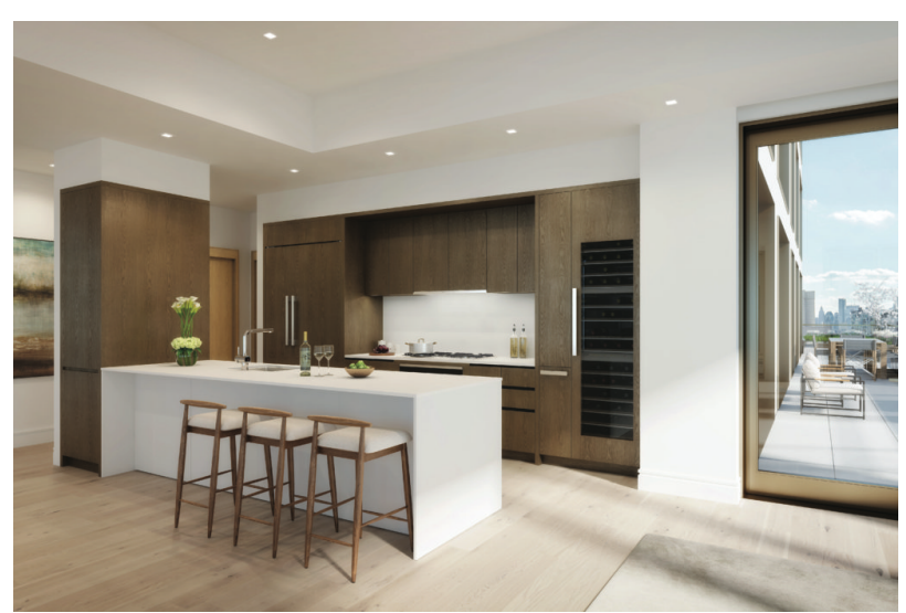
One of the apartment kitchens; artist rendering courtesy of Alfa Development

At 200 East 21st Street, gleaming new construction seamlessly integrates into the historic Gramercy Park area, balancing rock-star glamour (Anton Perich portraits of Factory-area Warhol and the downtown demimonde adorn the entryway) with earth-friendly elements in a luxurious 21-story building. From the lobby's living green wall featuring indigenous plants to the green roof, which provides natural insulation and reduces "heat island effect," meticulous attention has been paid to eco-details. Oversize double-paned European windows with tasteful bronze frames and high thermal performance bring in abundant natural light, while reducing noise pollution and heat gain.